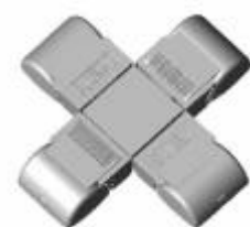
Quad Arm Cover QADCV4