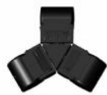
Triple Arm Cover QADCV3