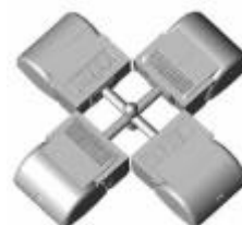
Quad Arm Bracket QADBK4