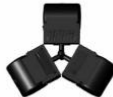
Triple Arm Bracket QADBK3