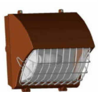
Wireguard option order catalog# QPA15WG.