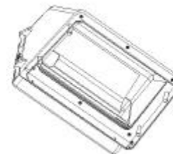
Polycarbonate shield option order catalog# QSC25PS .