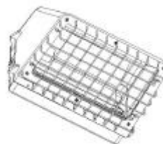
Wireguard option order catalog# QSC25WG .