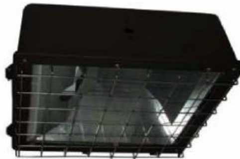
AL50 Shown with clear lens and wireguard option.

Labels: U/L, IP65 listed suitable for wet location, under covered canopy applications.