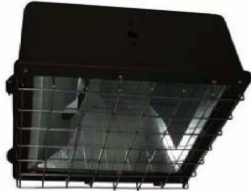
AL75 Shown with clear lens and wireguard option.

Labels: U/L, IP65 listed suitable for wet location, under covered canopy applications.