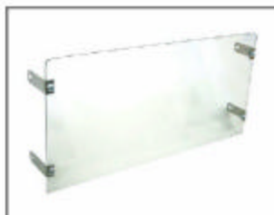
WP109VS Vandal Shield